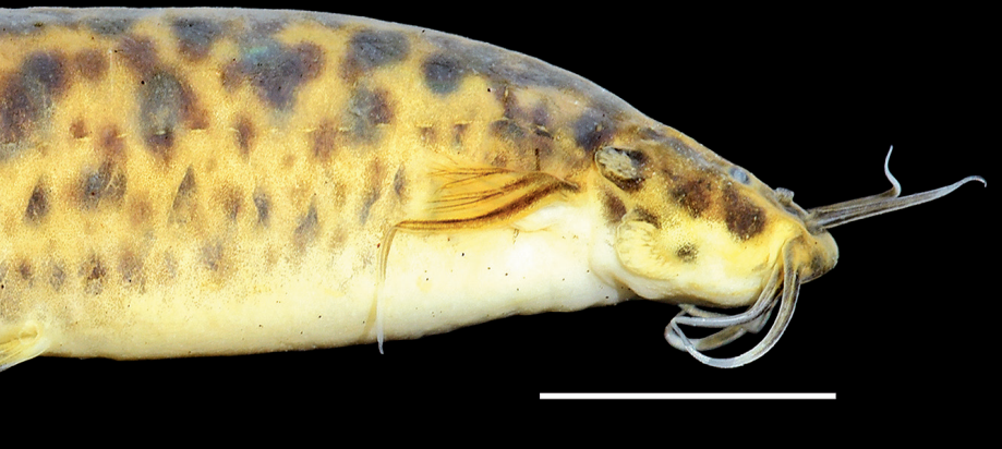
Top: This new Trichomycterus species was distributed between Orinduik Falls and the upstream waterfalls at Kaibarupai.