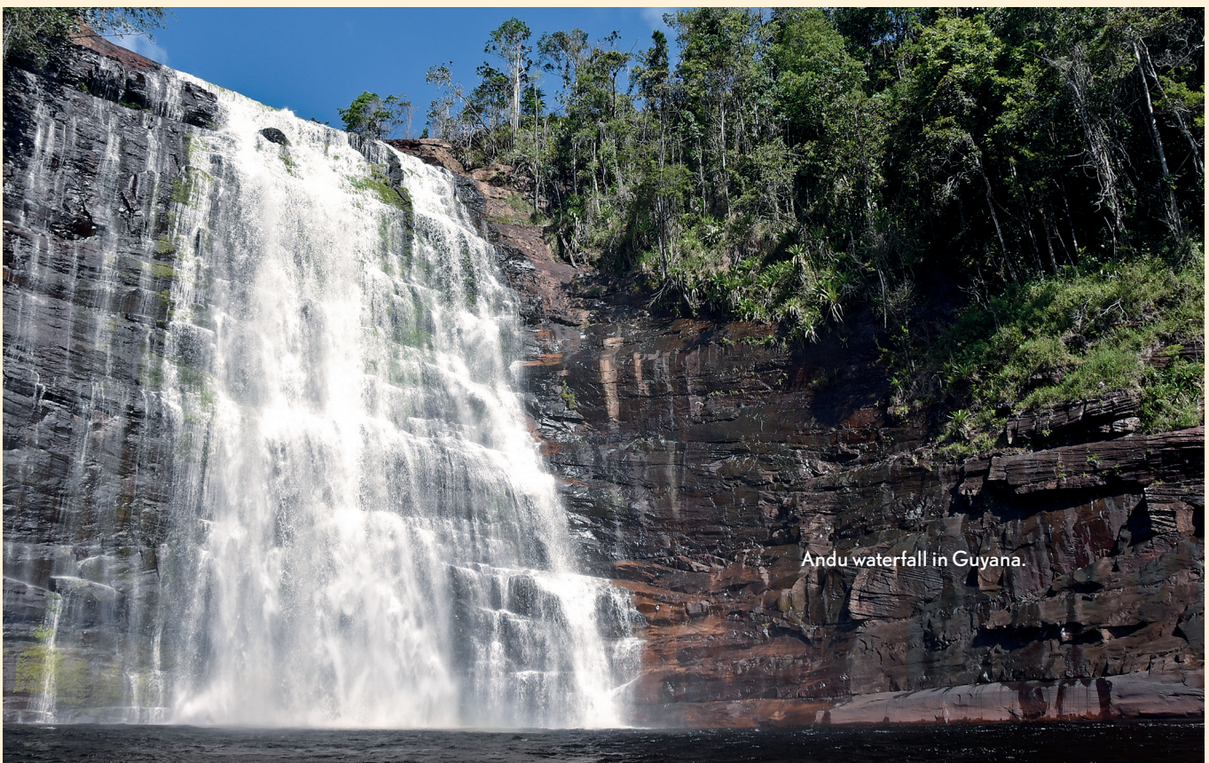
Andu waterfall in Guyana.

To resolve these questions more definitively, and to fit these puzzle pieces into a phylogenetic picture that sheds