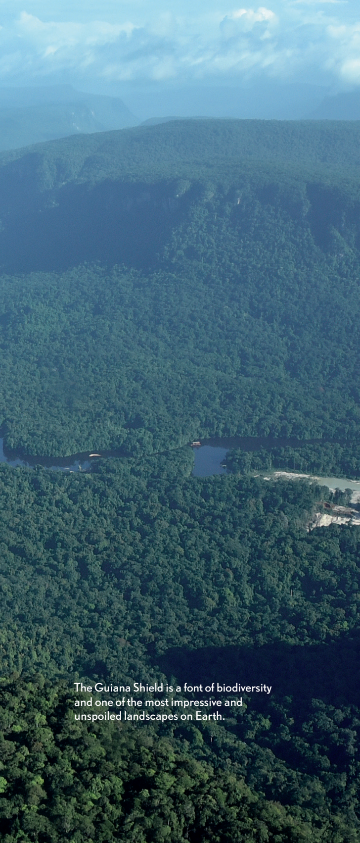
The Guiana Shield is a font of biodiversity and one of the most impressive and unspoiled landscapes on Earth.