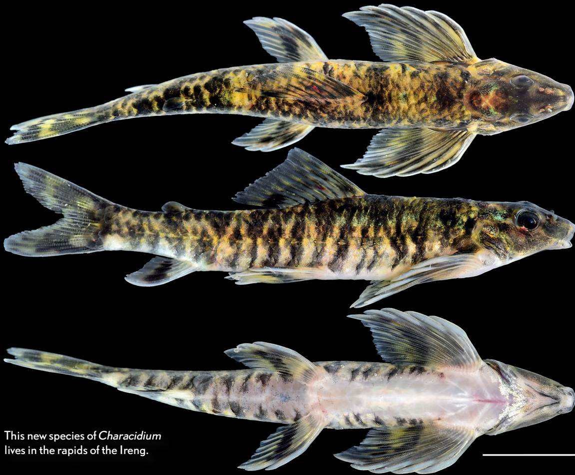
This new species of Characidium lives in the rapids of the Ireng.

We now know from geologic evidence, for example, that the vast Guiana Shield plateau, now approximately 1,300 feet (400 m) above sea level, was uplifted sometime in the Oligocene or Miocene geologic epoch, between 35 and 5 million years ago. In western Guyana, this uplift separated the upper Potaro River from the lower Potaro and appears to have isolated and helped preserve the endemic catfishes Lithogenes villosus , Corymbophanes andersoni , and Corymbophanes kaiei in the upper Potaro. Connecting the upper and lower Potaro is Guyana's most famous landmark, the thunderous Kaieteur Falls. Fossil-calibrated molecular phylogenies suggest that Corymbophanes separated from its closest relative elsewhere in South America approximately 18 million years ago, consistent with the geology-based date of the formation of Kaieteur Falls. Lithogenes appears to be even older.