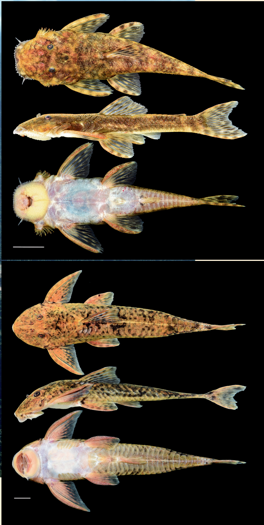
Top: One of the reasons for the expedition: Lithoxus bovallii . Note: The white bar in each photo represents 1 cm of length.